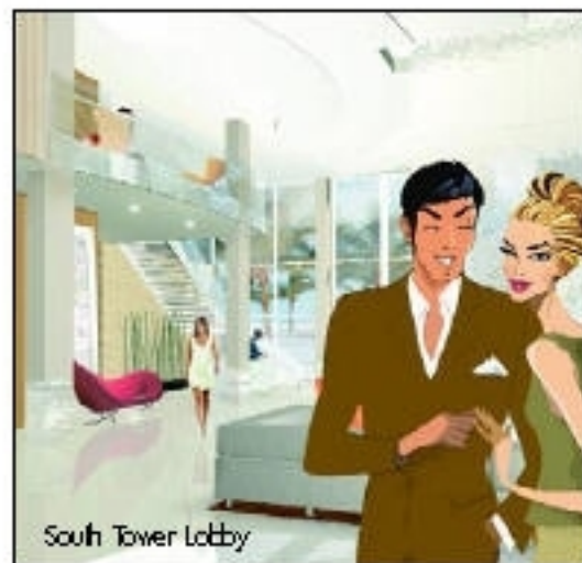
South Tower Lobby