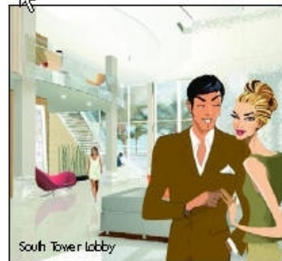
South Tower Lobby